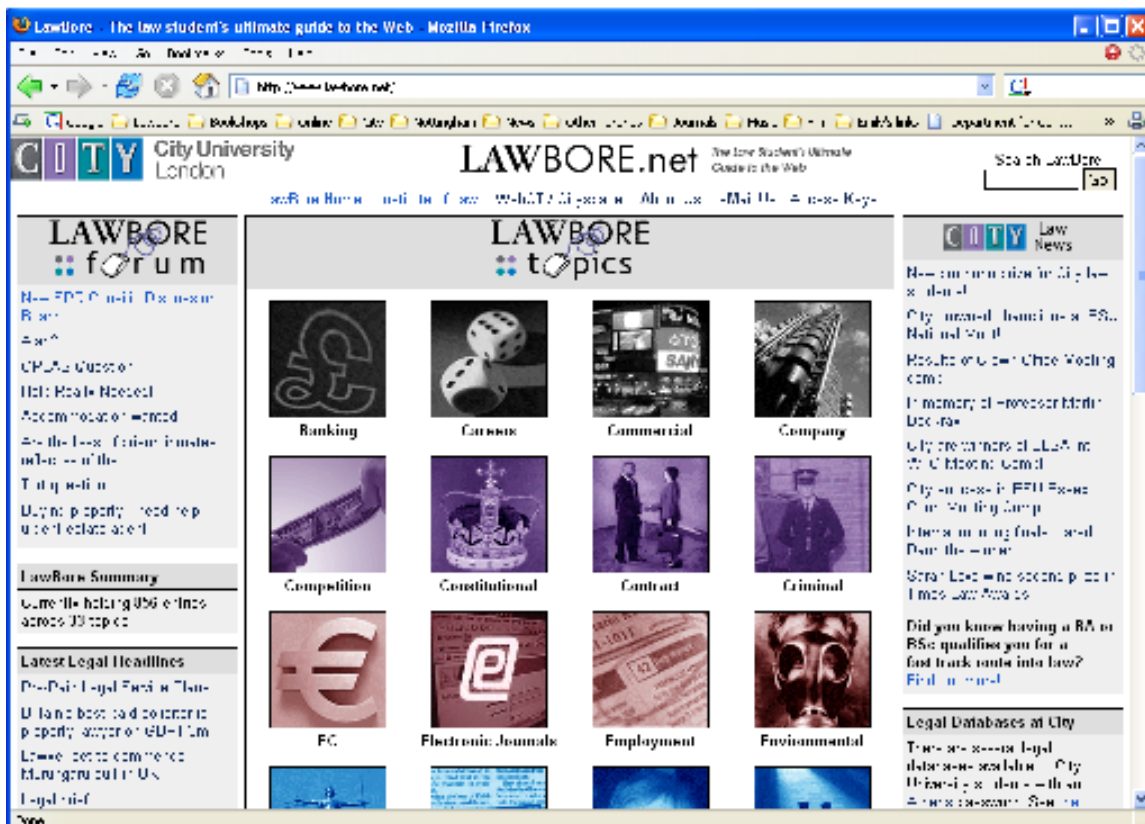
Fig 1. LawBore front page

As soon as I saw the theme of the Harrogate conference, 'Gateways, Gatekeepers and Gatecrashers', I wanted to contribute, although the thought of doing a session unnerved me. I was keen to talk about my gateway, LawBore, and how it had changed since I first wrote an article on it in Legal Information Management back in 2003, but I also wanted to convey how creating LawBore had changed things for me within my workplace.